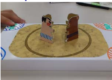
Paper Sumo Game